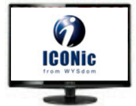
Hanns G Screens