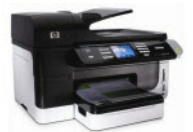
HP Colour Printers