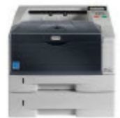
Kyocera Mono Printers