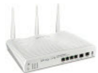
Draytek ADSL Routers